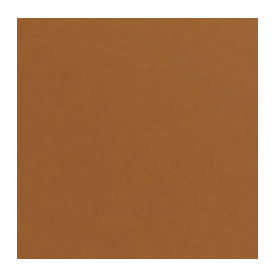
Copper Penny Mica JY-2570