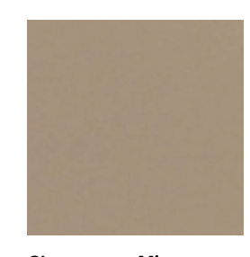
Champagne Mica JY-2550