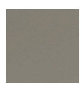
JLR Gray Metallic JY-3550