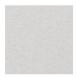
Silver Metallic 🕸

Micas and metallics are directional finishes requiring panels to be installed in the same orientation to minimize the chance of visual color differences. Panels should always be installed with the arrows on the protective film facing the same direction.