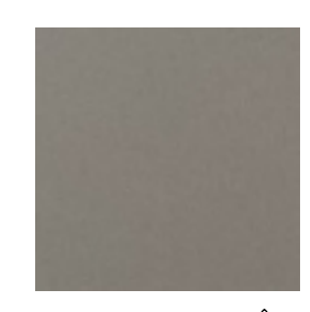
West Pewter Mica II 🕸