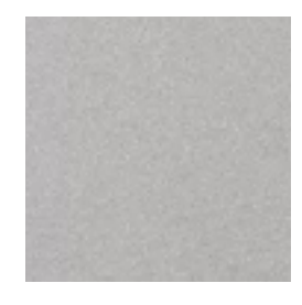
Sunrise Silver Metallic II 🕸