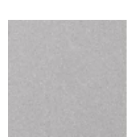
Champagne Metallic 🕸